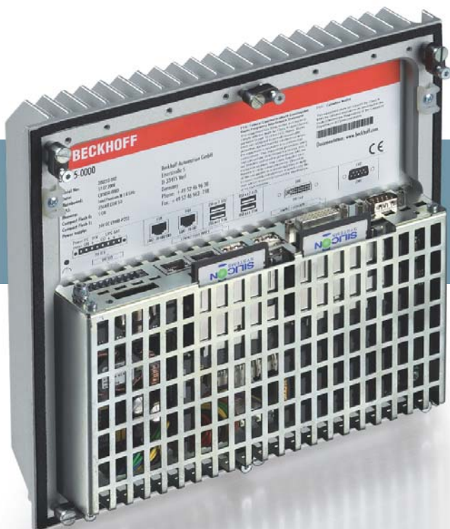
Flying by Foy's control solution is mounted in a 3.5" rack using a Beckhoff C6515 Industrial PC.