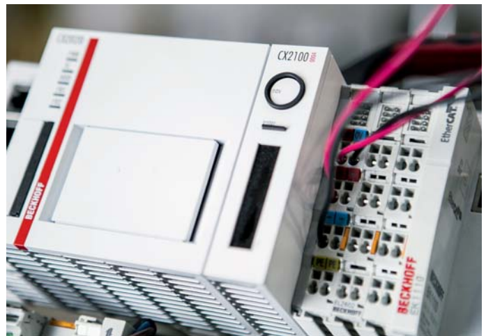
A CX2020 Embedded PC with 1.4 GHz Intel® Celeron® CPU serves as the basis of the automation system at the Minto, Ontario power facility. The PC-based control platform provides powerful operation, as well as ease of expansion and upgradeability.

The robust design of the EtherCAT Box modules has drastically reduced electrical cabinet needs on the flywheel portion of Temporal Power systems. The fully-sealed I/O modules with IP 67 rating are mounted directly onto the flywheels, saving space and reducing costs. "The EtherCAT Box modules work very well for our installation needs. Since the flywheel systems are located in vaults below ground, we need protection from moisture, vibration, and temperature variation," according to Jeff Veltri.